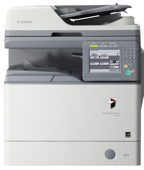
The image shown above is the imageRUNNER 1750i

Compact and space saving, these highspeed A4 devices are ideal for busy offices. Productive multifunctional capabilities save time while cost saving features help you save money too.